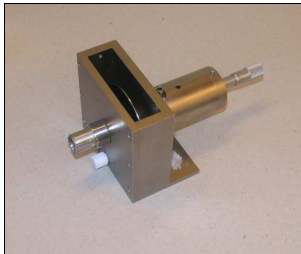
Figure 3 LD-3T High-Temperature Rigid Dielectric Cell