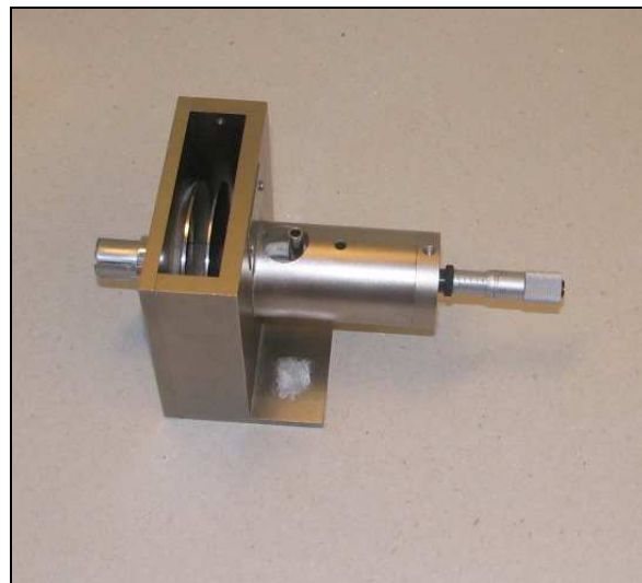
Figure 2 LD-3 Rigid Dielectric Cell