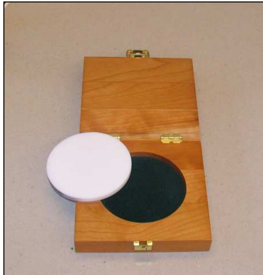
Figure 6 TS-100 Teflon Standard Cell