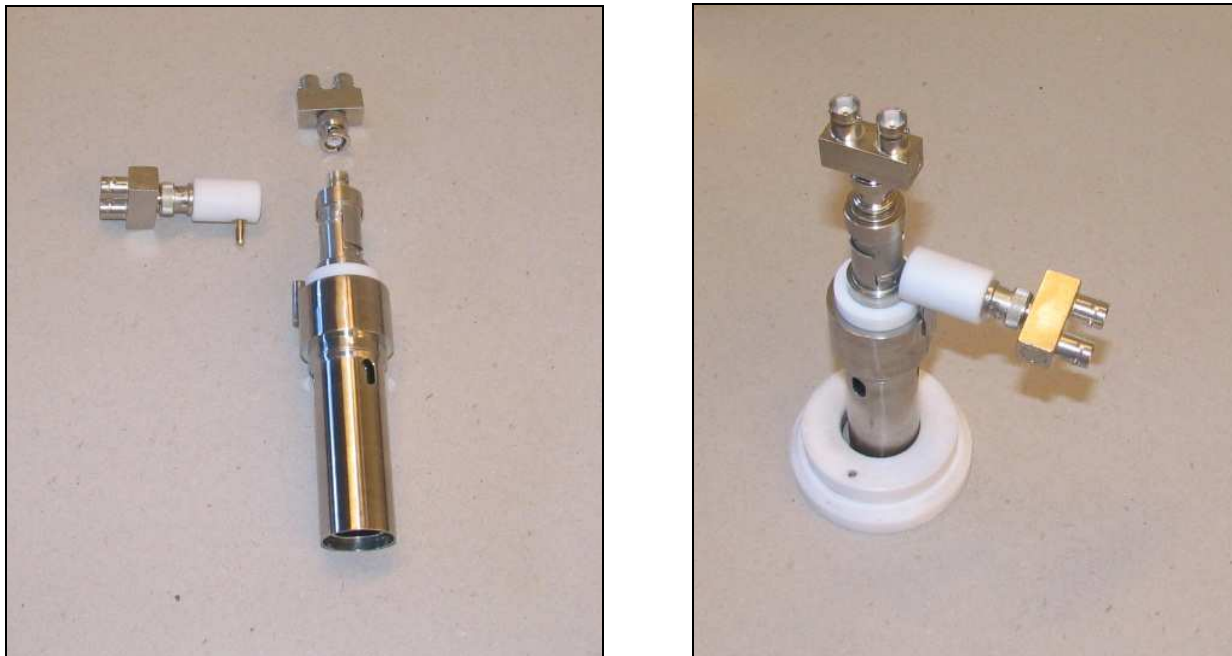
Figure 5 350 Liquid Cell