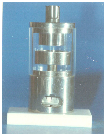
Figure 4 MC-100 Powder and Paste Dielectric Cell